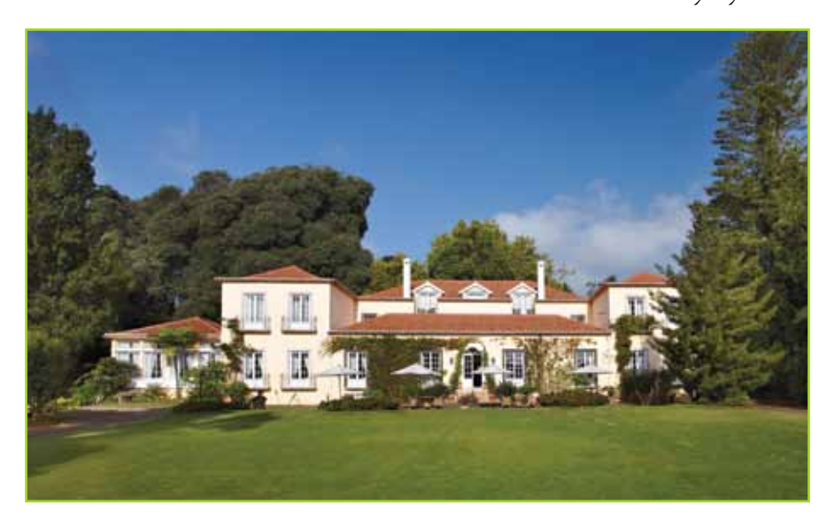
Saturday 3rd February - Saturday 10th February 2018